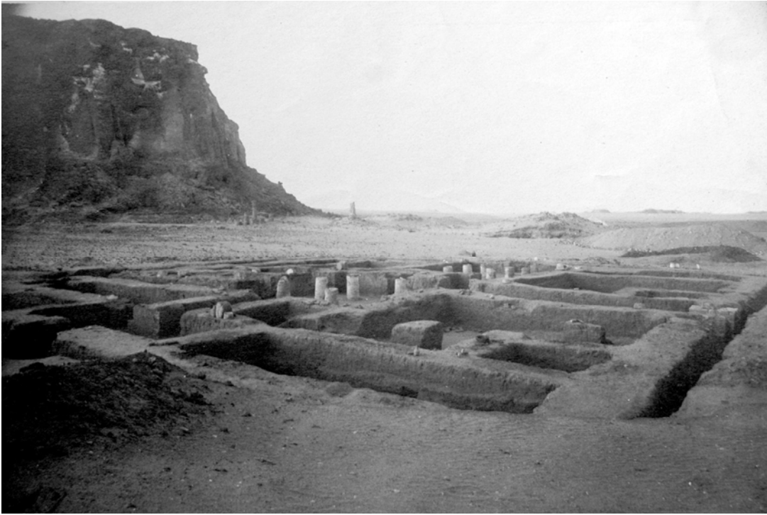
fig. 2: Photograph of B 100 following excavation, March 15, 1916, looking north toward B 500. Photo A 2326, from the photographic archive of G. A. Reisner's Harvard University-Museum of Fine Arts, Boston Expedition. Photographer: Mohammedani Ibrahim Ibrahim © Museum of Fine Arts, Boston.